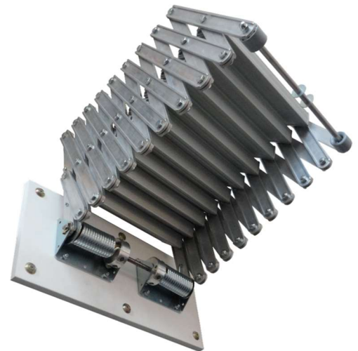
Spring-assisted operation of the retractable ladder (Piccolo Premium)