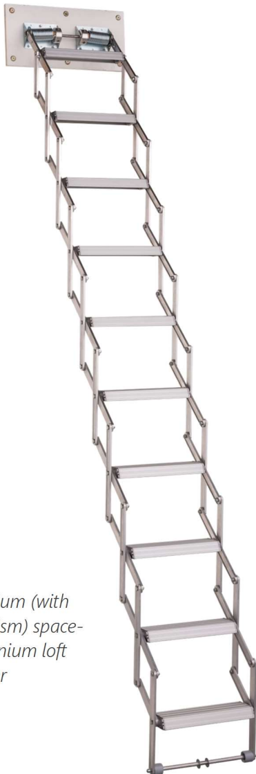
Piccolo Premium (with spring mechanism) space-saving aluminium loft ladder

The Piccolo's compact, space-saving design makes it the perfect loft ladder for very small ceiling openings or use in an existing hatch box. It is also available as the Piccolo Premium, featuring a spring mechanism to assist with opening and retracting the loft ladder; making it very easy to operate and improving safety