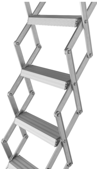
The Piccolo is manufactured from light-weight aluminium profile